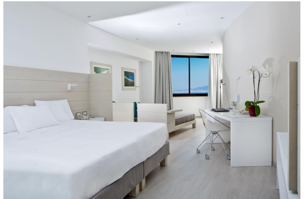
Deluxe Sea View Rooms