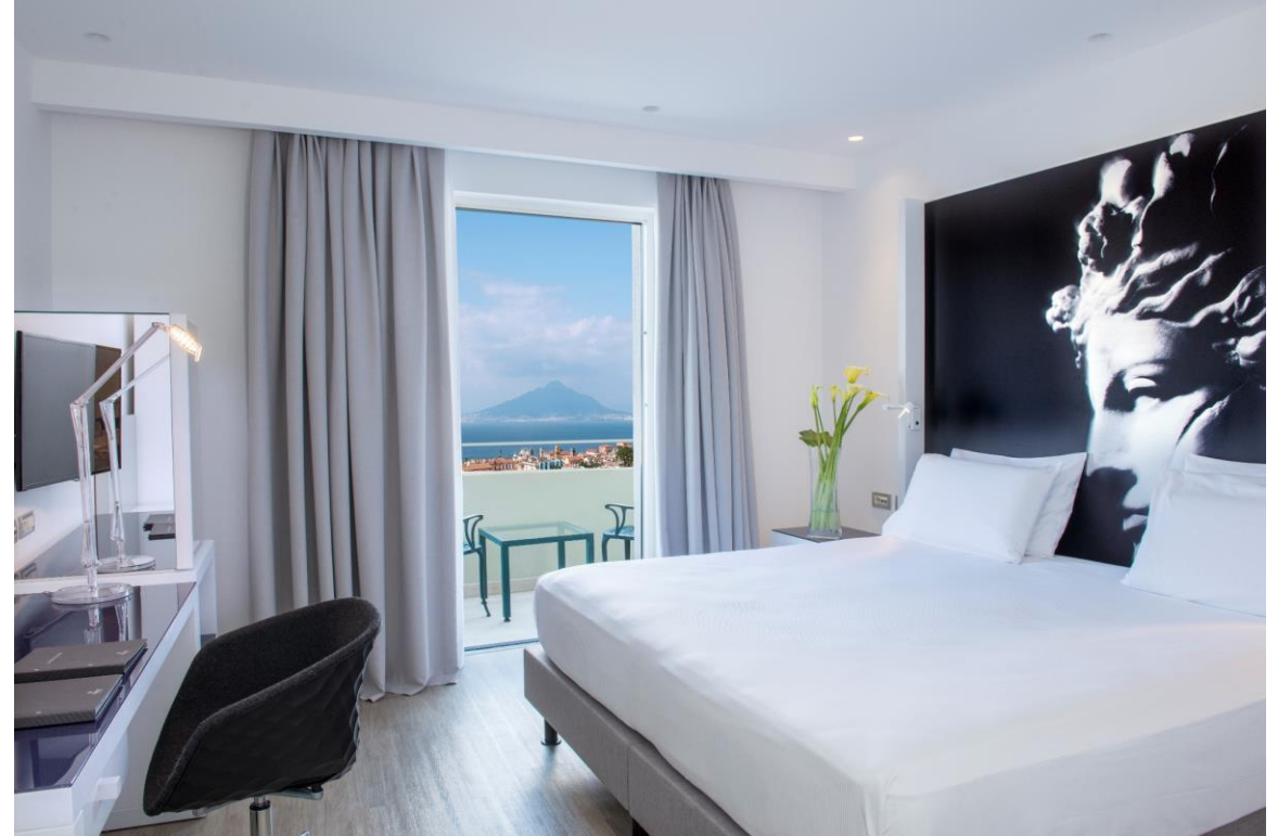
King Superior Rooms