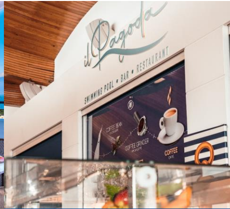
La Pagoda Pool Bar