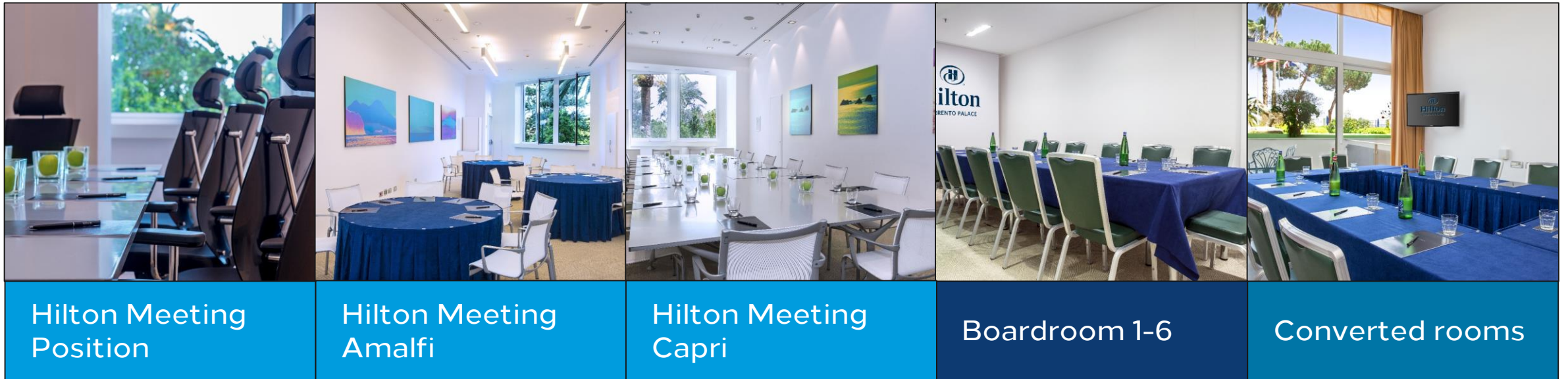
Hilton Meeting Position