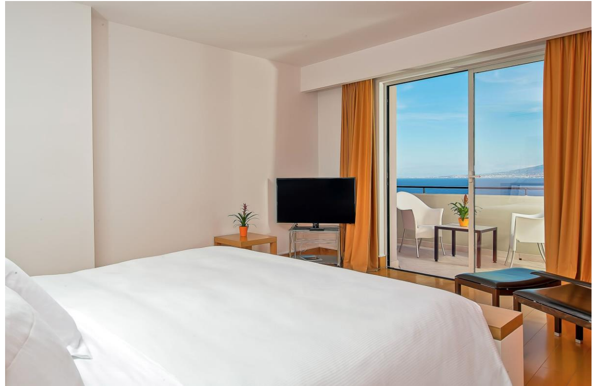
King Executive Sea View Rooms