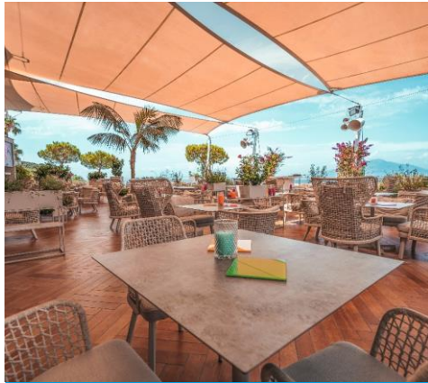
La Terrazza Lounge Bar