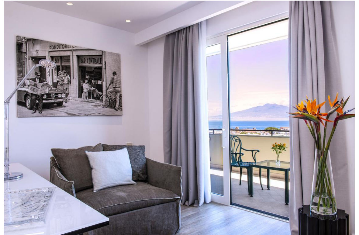
Junior Suite Sea View