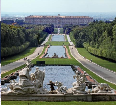
Royal Palace of Caserta