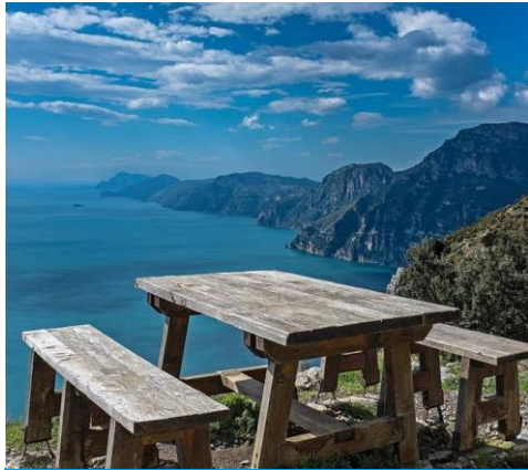
Path of Gods

A hike through hillside villages and heart-stopping views of the Amalfi Coast.