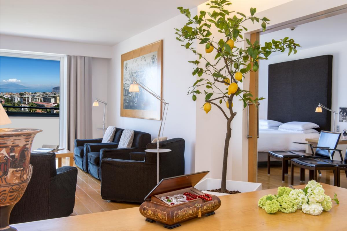
King Executive Suite Sea View