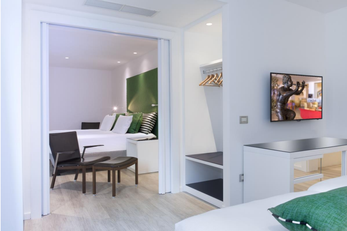
Quadruple Family Rooms