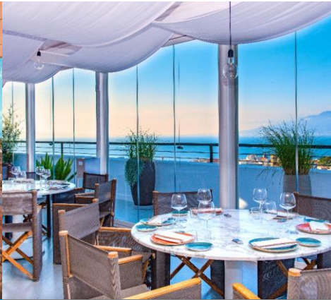
J Contemporary Restaurant Sorrento