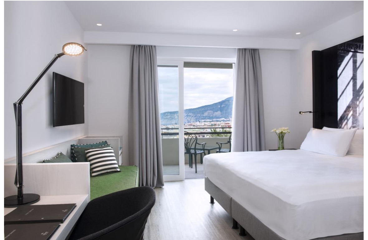
Triple Superior Rooms