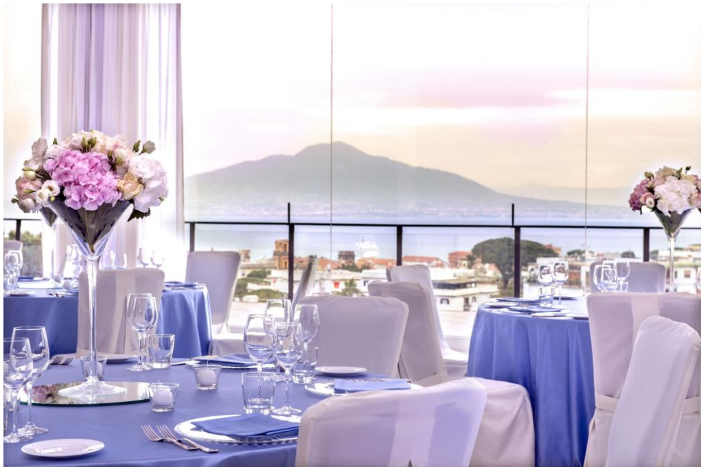
L'Alba up to 1000 delegates